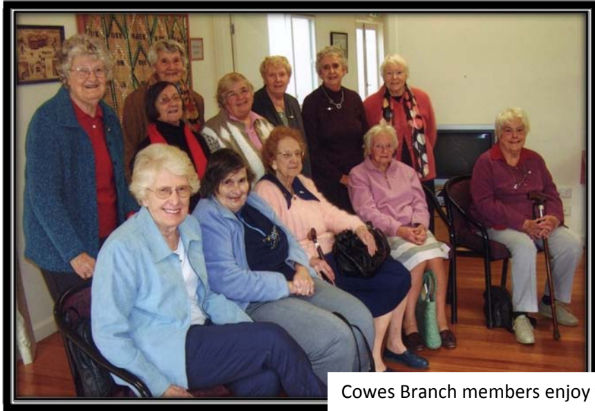
Cowes Branch members enjoy fellowship at their May meeting.