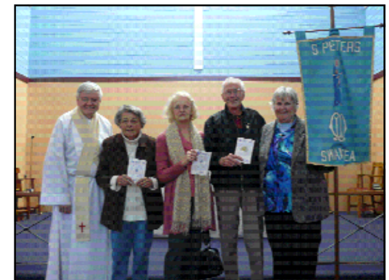
Presentation to three new members