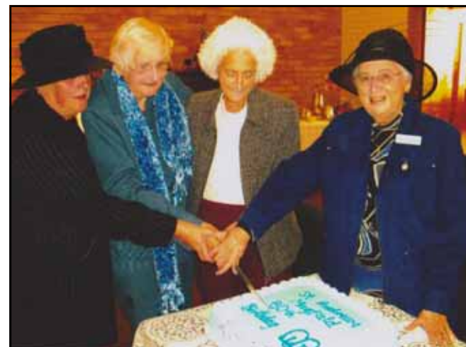
The cutting of the Birthday Cake