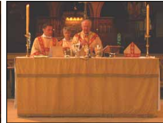
Lady Day 2011