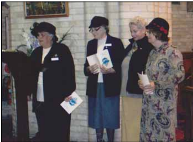
Two new members admitted