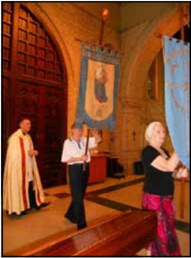
The banner procession