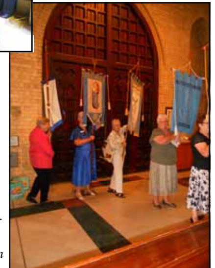
More of the banner procession