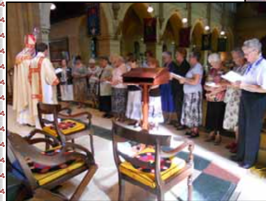
The commissioning of the new executive